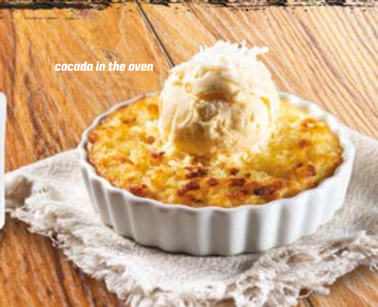
cocada in the oven