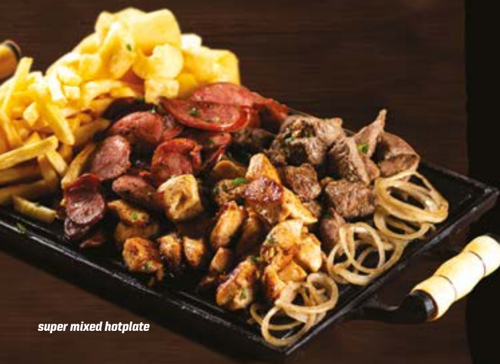
super mixed hotplate