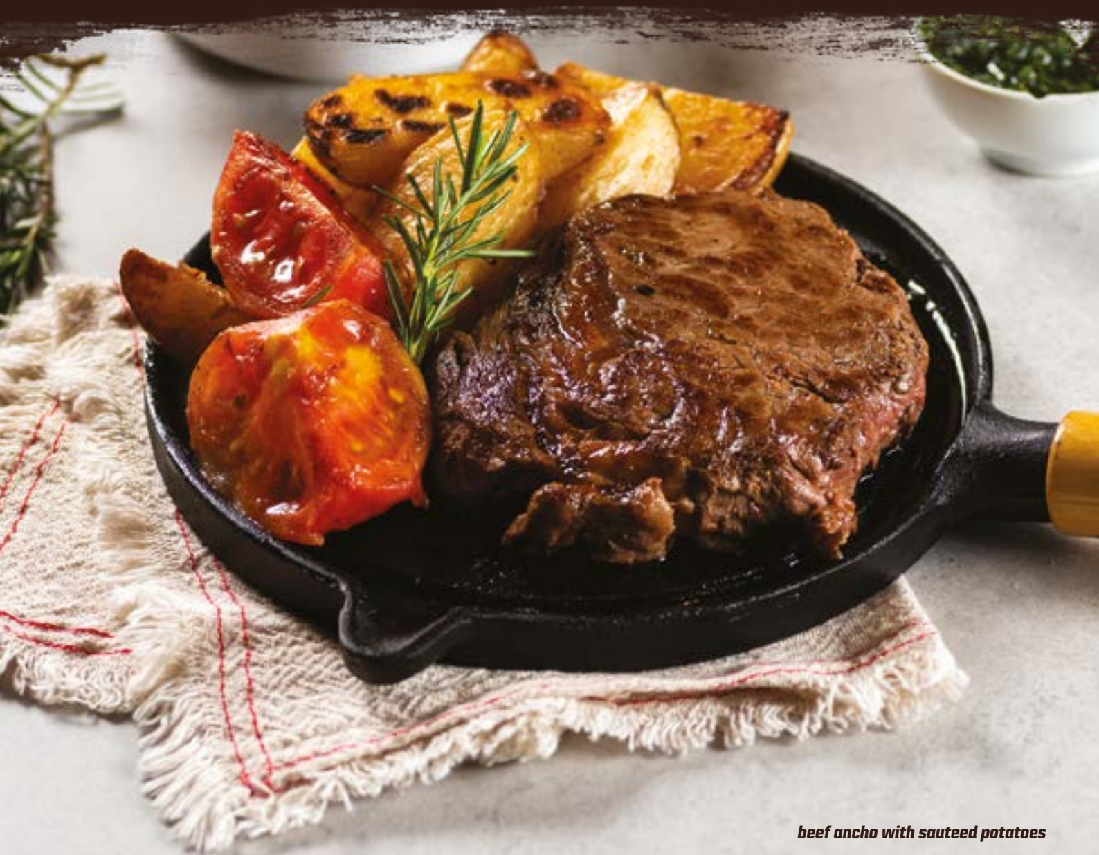
beef ancho with sauteed potatoes