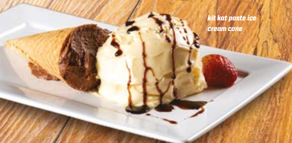
kit kat paste ice cream cone