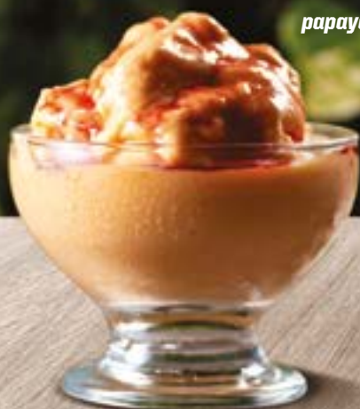
brazilian papaya cream