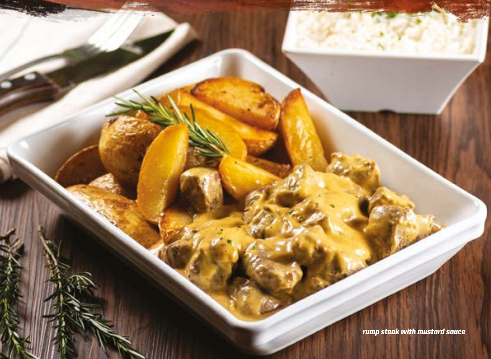
rump steak with mustard sauce