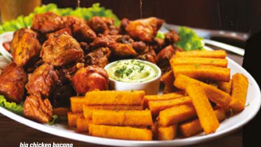
big chicken bacana