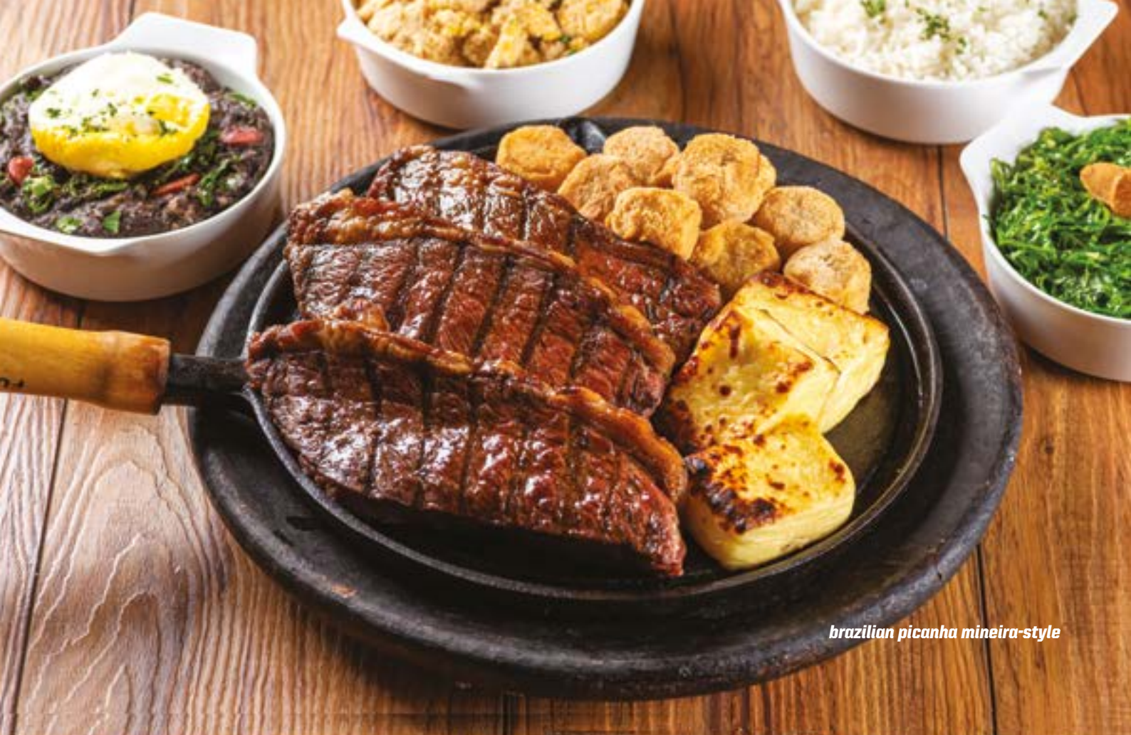
brazilian picanha mineira-style