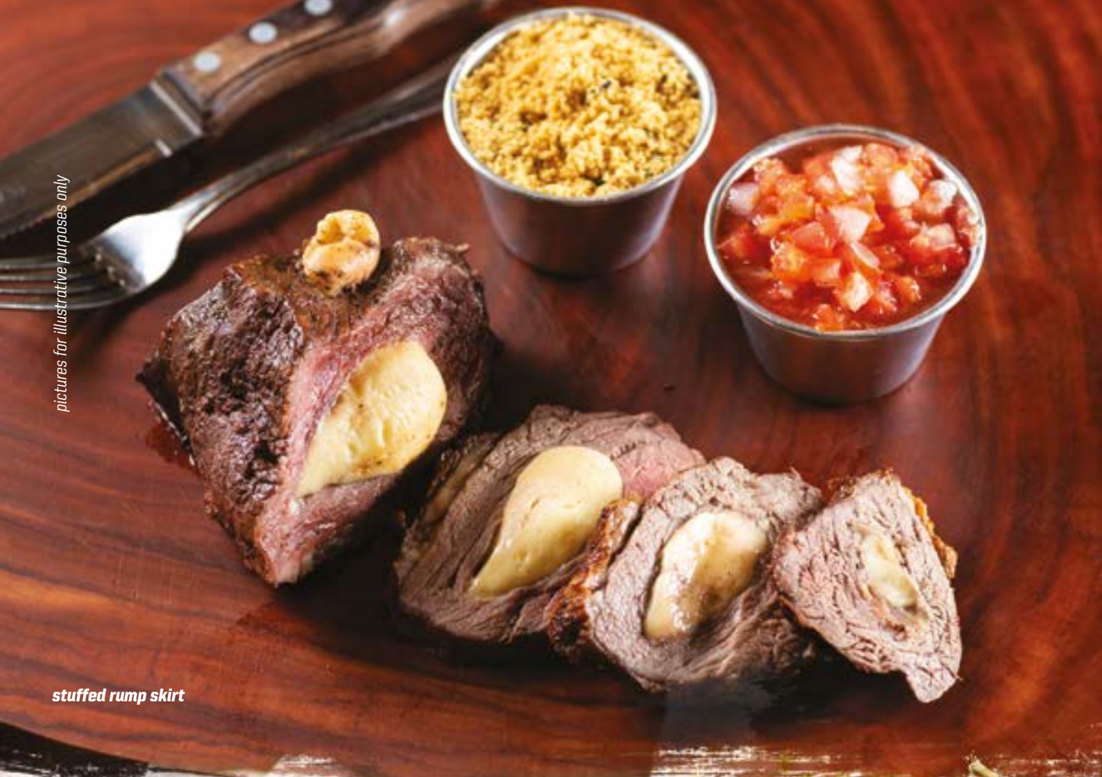
stuffed rump skirt